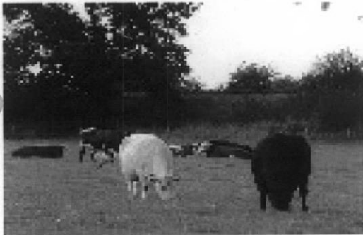
(Location behind planning application)

A: No. Government policy does allow for exceptions to be made to Green Belt policy where there are Very Special Circumstances that outweigh the harm to the Green Belt. The lack of suitable alternative sites to meet an identified need can be put forward as part of a case of very special circumstances but these are rarely successful. Warwick District Council has previously been successful at appeal in defending a Green Belt site from development as a permanent site for Gypsies and Travellers. Green Belt sites may have to be considered however if there are no alternative sites made available for this use.