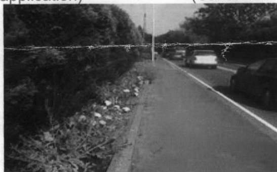
(A4177 road adjacent to the planning application.)