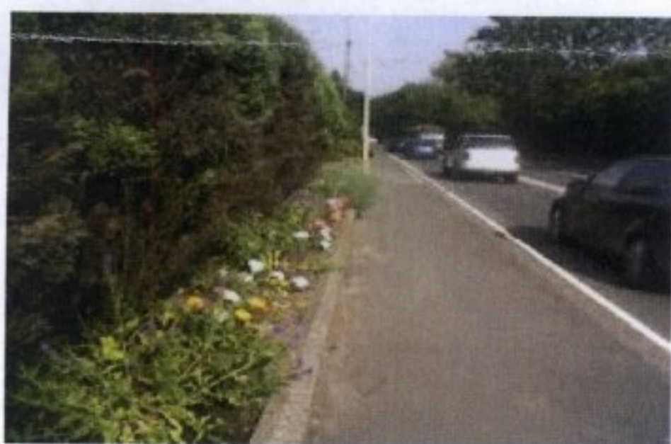
(A4177 road adjacent to the planning application.)

→ Accident in the same location March 2014. The previously damaged road sign in the picture would indicate the turn into GT19.