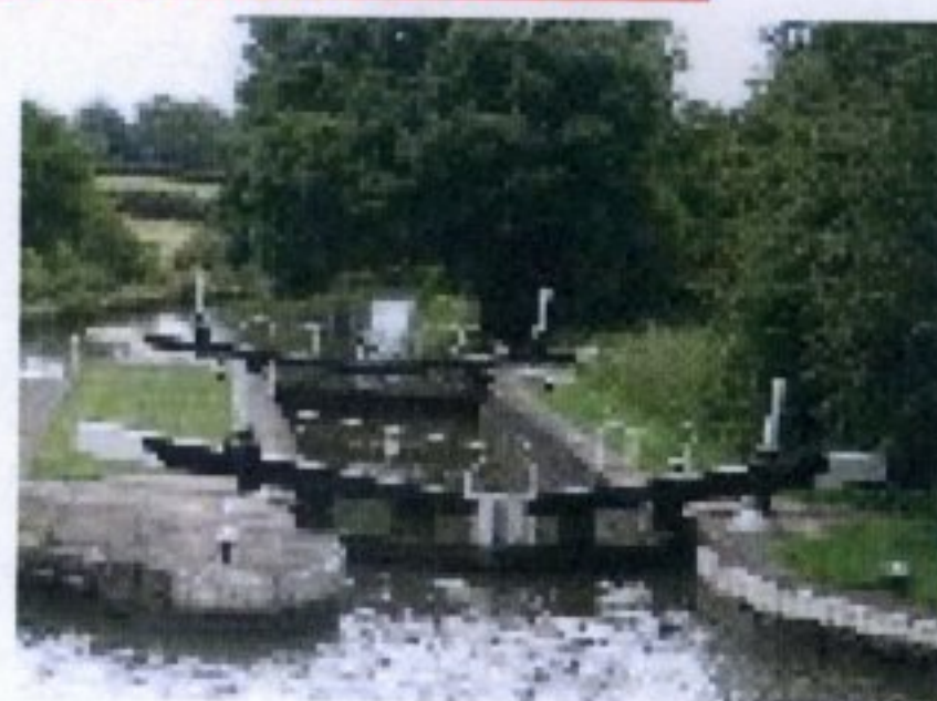
(Canal next to planning application.)