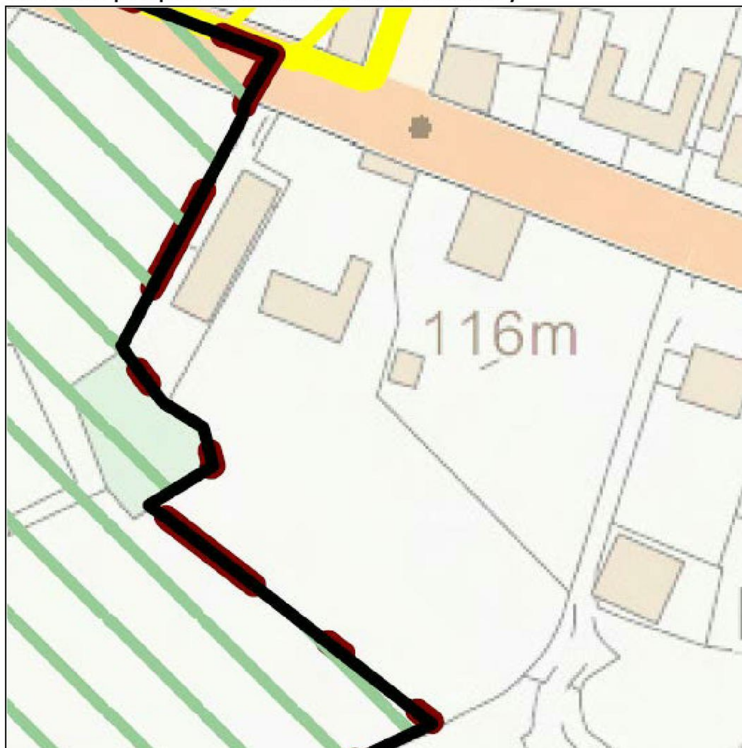
Current proposed settlement boundary