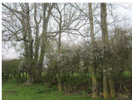
Eastern boundary hedgerow on raised bank.

The site's eastern boundary comprises a defunct species-poor hedgerow on a raised bank, the hedgerow becoming increasingly gappy towards the north of the site. The hedgerow is dominated by hawthorn, with occasional elder and blackthorn and some semi-mature trees including ash. Ground flora includes common nettle, spear thistle and meadow-grass sp. There is a lot of rabbit activity at the base of the hedgerow.