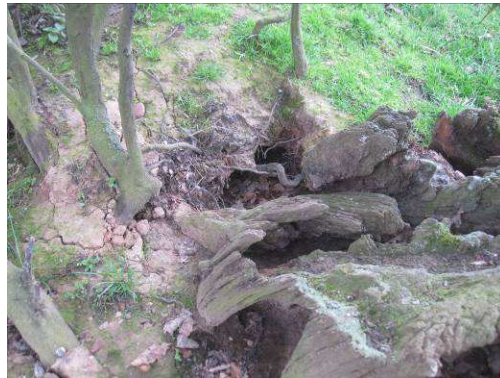
Possible disused badger sett in linear scrub, north of site.

A possible disused badger sett with four entrances was located within the linear scrub feature towards the north of the site (thought to be the old field boundary). The holes now appeared to be occupied by rabbits, although were of a size and shape more associated with badger than rabbit.