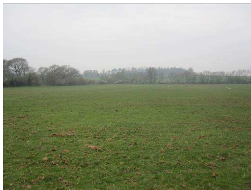
Improved grassland field.

The majority of the site comprises improved grassland dominated by perennial ryegrass Lolium perenne and used as sheep grazing pasture at the time of survey. Other species recorded in the sward include common nettle Urtica dioica , creeping buttercup Ranunculus repens , common mouseear Cerastium fontanum , dandelion Taraxacum officinale agg., and locally frequent lesser celandine Ranunculus ficaria , common chickweed Stellaria media and cleavers Galium aparine to the north of the field close to the boundary hedgerow. There was an area of boggy grassland close to the large pond towards the south of the site during the survey. However, the sward's species composition did not vary in this area, suggesting it was an ephemeral state caused by recent rainfall.