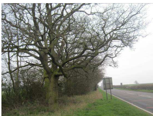
Northern edge of woodland strip.

A narrow strip (up to 10 m wide) of remnant broadleaved semi-natural woodland runs along the A452 road verge, just outside the site's western boundary fence. The canopy is dominated by oak, including some large mature specimens. The understorey includes wild privet Ligustrum vulgare , blackthorn, hawthorn and hazel Corylus avellana . Ground flora is dominated by ivy Hedera helix and bramble and also includes ground ivy Glechoma hederacea , cleavers, creeping buttercup, lesser celandine, honeysuckle Lonicera periclymenum , hedge woundwort Stachys sylvatica , creeping thistle Cirsium arvense , dock sp, lords and ladies, cow parsley Anthriscus sylvestris , white dead nettle Lamium album , herb Robert Geranium robertum , wood avens Geum urbanum and locally frequent false wood brome Brachypodium sylvaticum . A dry ditch runs through this section, which probably fills during heavy rain due to run-off from the road. The species recorded on its banks are a continuation of the woodland flora, notably dense ivy. There are numerous areas of deadwood on the floor and scattered patches of dense bramble scrub throughout the length of the woodland.