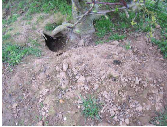
One of the active entrances of main sett, southern boundary hedgerow.

A possible disused badger sett with four entrances was located within the linear scrub feature towards the north of the site (thought to be the old field boundary). The holes now appeared to be occupied by rabbits, although were of a size and shape more associated with badger than rabbit.