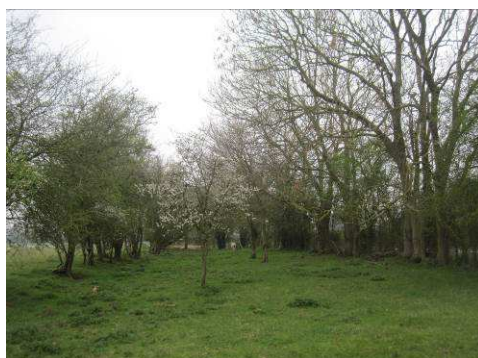
Two parallel lines of linear scrub, northern edge of site.

There is a line of planted scrub towards the north of the site, parallel with the northern boundary fence. Most of the trees are old hawthorn, elder and blackthorn specimens, possibly the remains of a previous field boundary. However, there are also some younger specimens including ash and oak. There is a possibility that some of the old hawthorn trees may be midland hawthorn Crataegus laevigata , but this was not possible to confirm at the time of survey as the leaves had not fully formed.