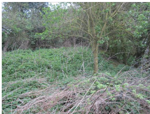
Dense nettle vegetation, Pond 2.