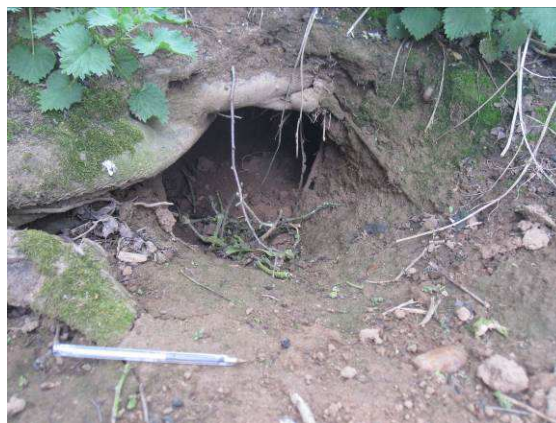
One of the active entrances of main sett, Pond 2.

An active main badger sett with at least 12 entrances, many of which exhibited fresh spoil, was recorded to the south of pond 2, which is located at the southern end of the site. The sett is clearly well-used as a number of well-worn badger tracks linked sett entrances and a number of badger hairs were found.