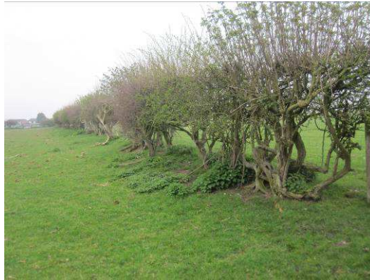
Southern boundary hedgerow.