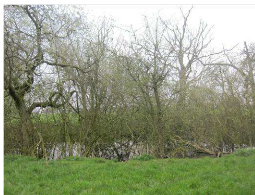
Linear scrub surrounding Pond 3.