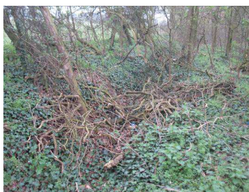
Dry ditch with dense ivy ground flora.