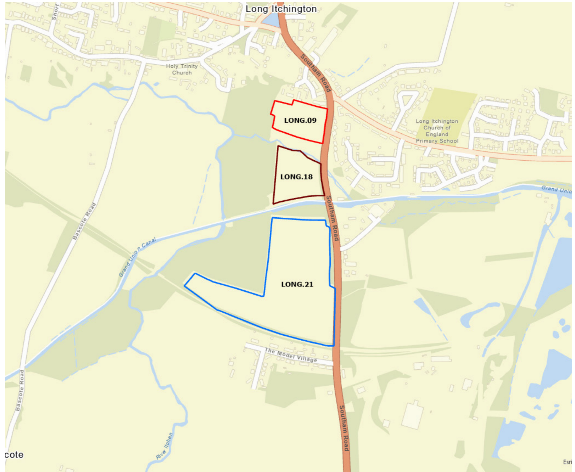
Figure 1.1: Site Location

To this end, Section 3 of this report provides an assessment of the heritage assets considered within this report, and provides a description of the assets, together with an analysis of their significance and the degree to which their setting contributes to their significance. Section 4 then provides an assessment of the potential impact of allocation of the three parcels, on three separate Options on the significance and