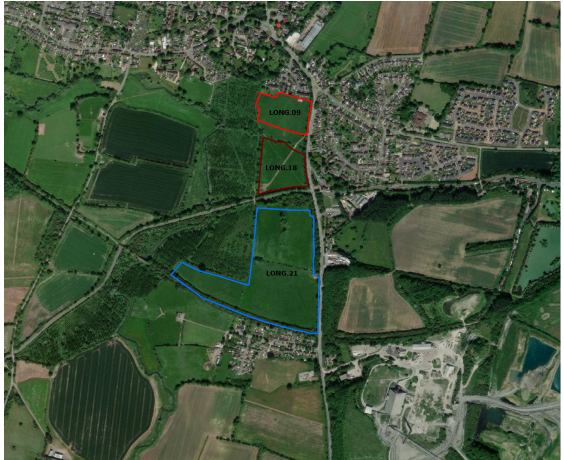
Plate 1.1: Satellite imagery of the Site

Option 1 includes for development on LONG.09, supporting a small-scale addition to the village, delivering c.45-55 dwellings with a density of 30-35pdh. Option 2 includes for the development on LONG.09 and LONG.18, supporting a medium-scale addition to the village across both sites, delivering c.80-100 dwellings, again with a density of 30-35dph. Option 3 includes for development across the three parcels of land, delivering a potential additional development in excess of 100 extra dwellings alongside community use facilities and/ or a school, dependant on local requirements and discussions with local stakeholders.